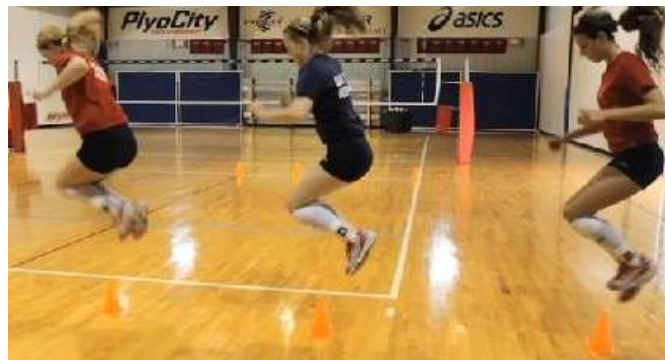
If volleyball were easy, they'd call it American football.

We hope you make new friends and positive memories.