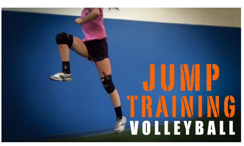
My boyfriend told me I had to choose between him and volleyball... I'm really going to miss him.