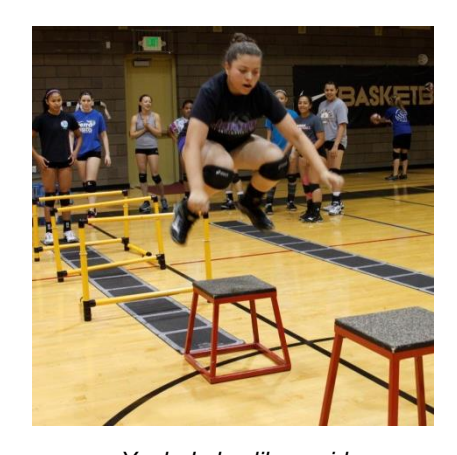
Yeah, I play like a girl. You got a problem with that?