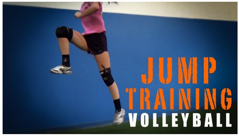
My boyfriend told me I had to choose between him and volleyball... I'm really going to miss him.